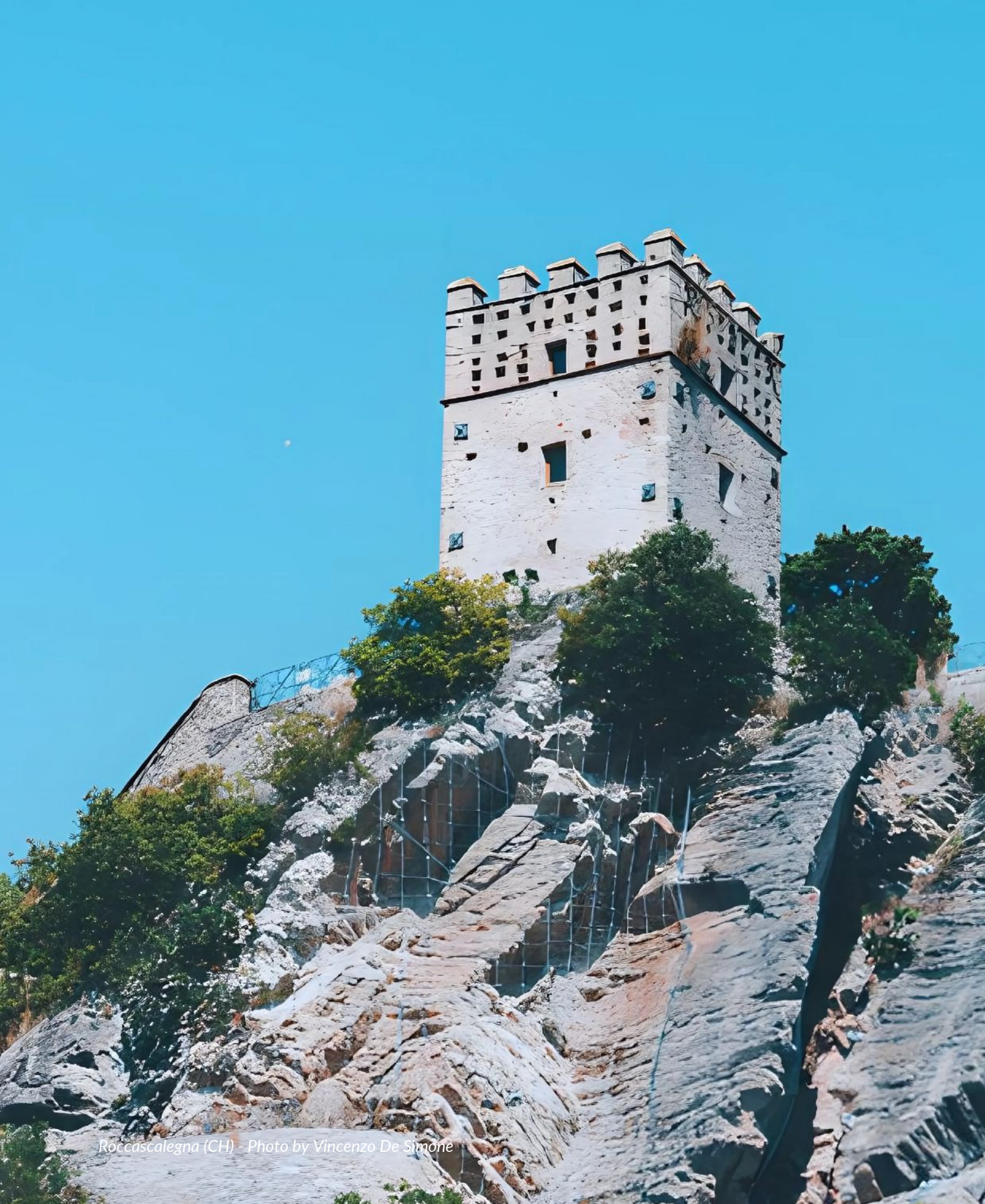
Roccascalegna (CH)