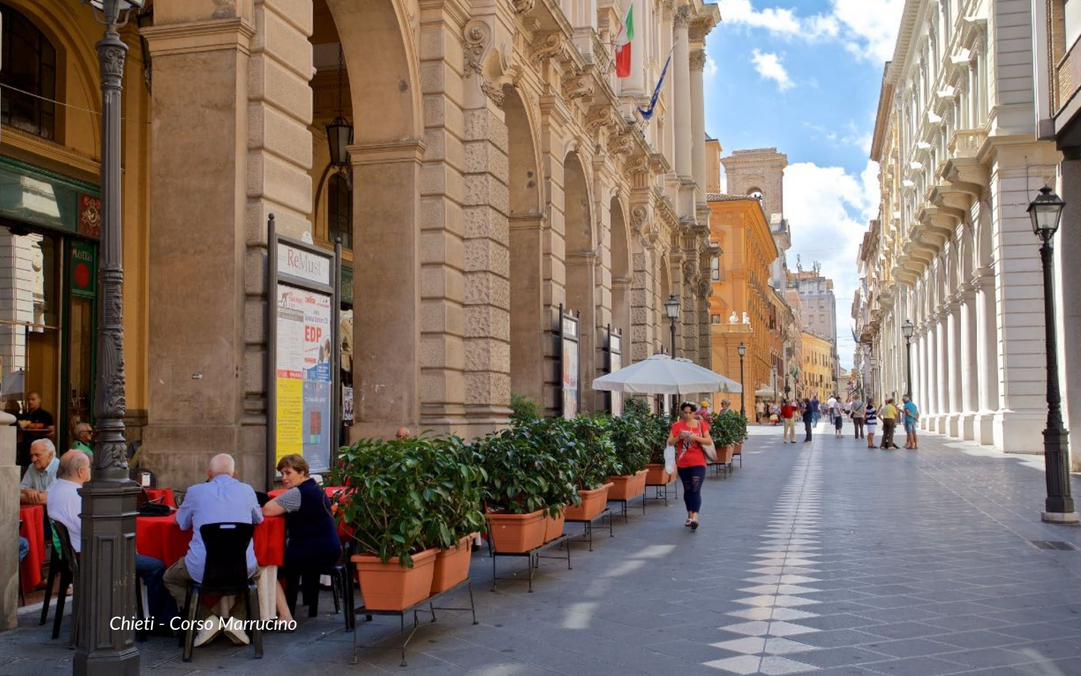
Chieti - Corso Marrucino