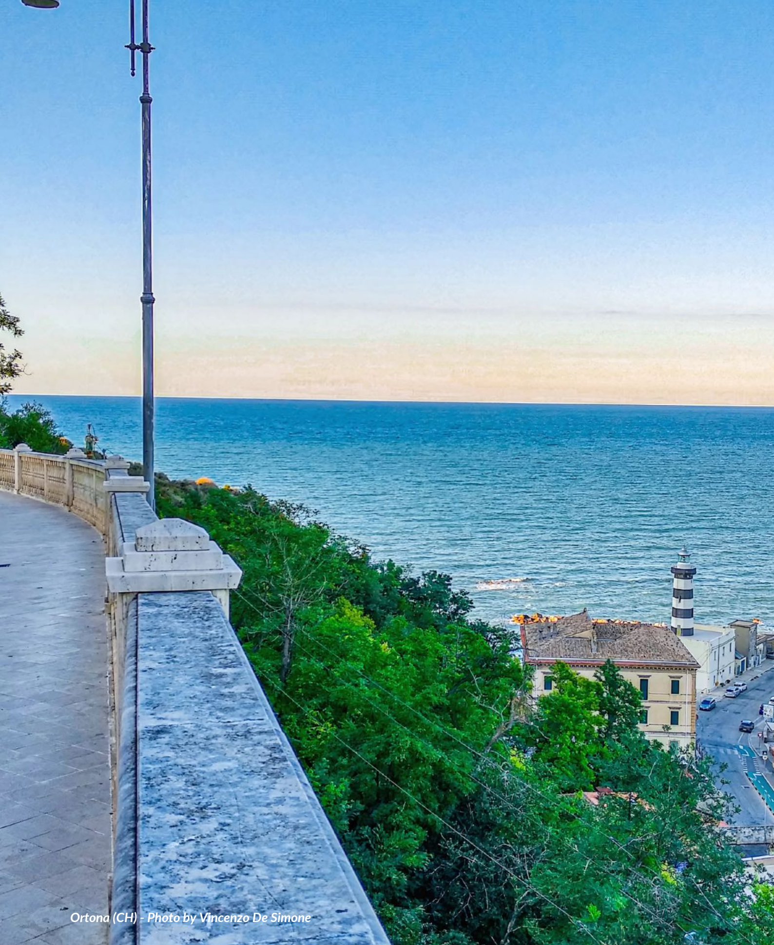
Ortona (CH)