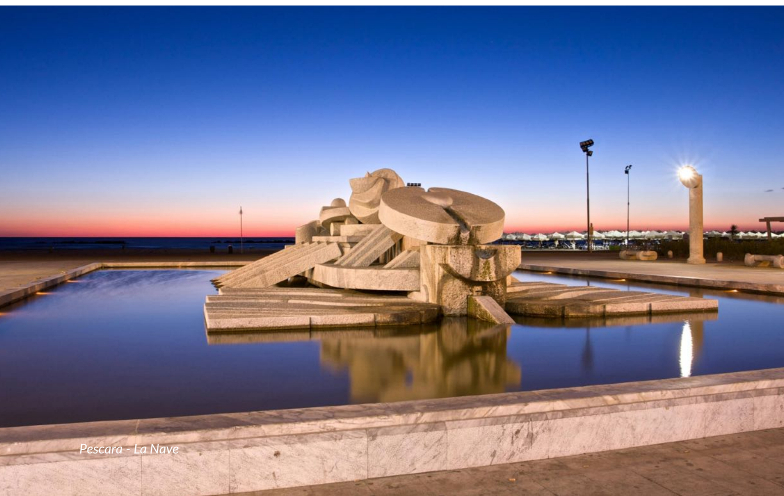
Pescara - La Nave