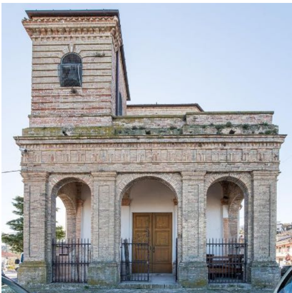
The church outside the site of one of my ancestral home sites

As travel trends shift towards uncovering hidden gems, Abruzzo stands out as the perfect destination for those seeking authentic experiences. From the tranquil Adriatic coastline to serene lakes, majestic national parks, and UNESCO heritage sites, Abruzzo is a treasure trove of natural and cultural wonders. Its charming historic towns rank among the most beautiful in Italy, while its diverse cuisine delights with flavours that vary from the coast to the mountains. Abruzzo encapsulates everything you dream of in an Italian getaway, offering an unspoiled and unforgettable experience.